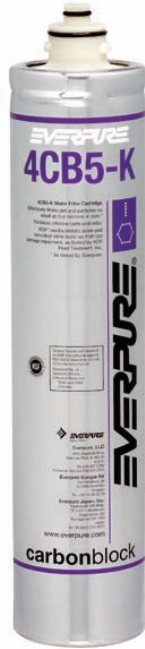
4CB5-K Replacement Cartridge: EV9617-36

Delivers quality water for foodservice, vending and OCS applications